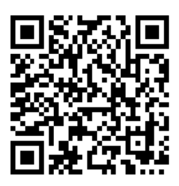
2014 ACA FLYER

MEMBERSHIP DUES ...... $15 per year ANNUAL MEETING ...... April